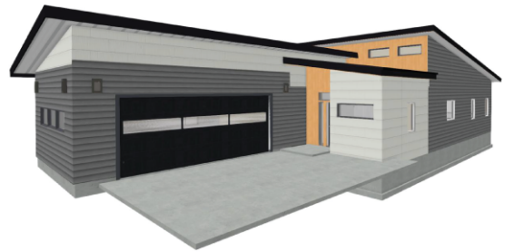
Side Garage Option