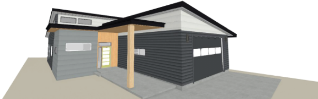
Front Garage Option